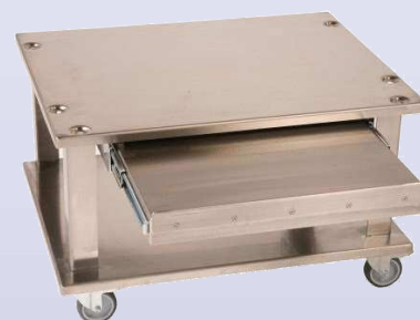
Option – mobile underframe TD 3000 L 52 x 67 x 36,5 cm (L x W x H)