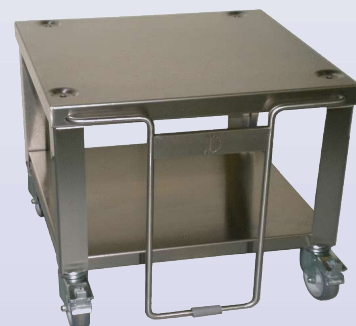
Option – mobile underframe TD 1500